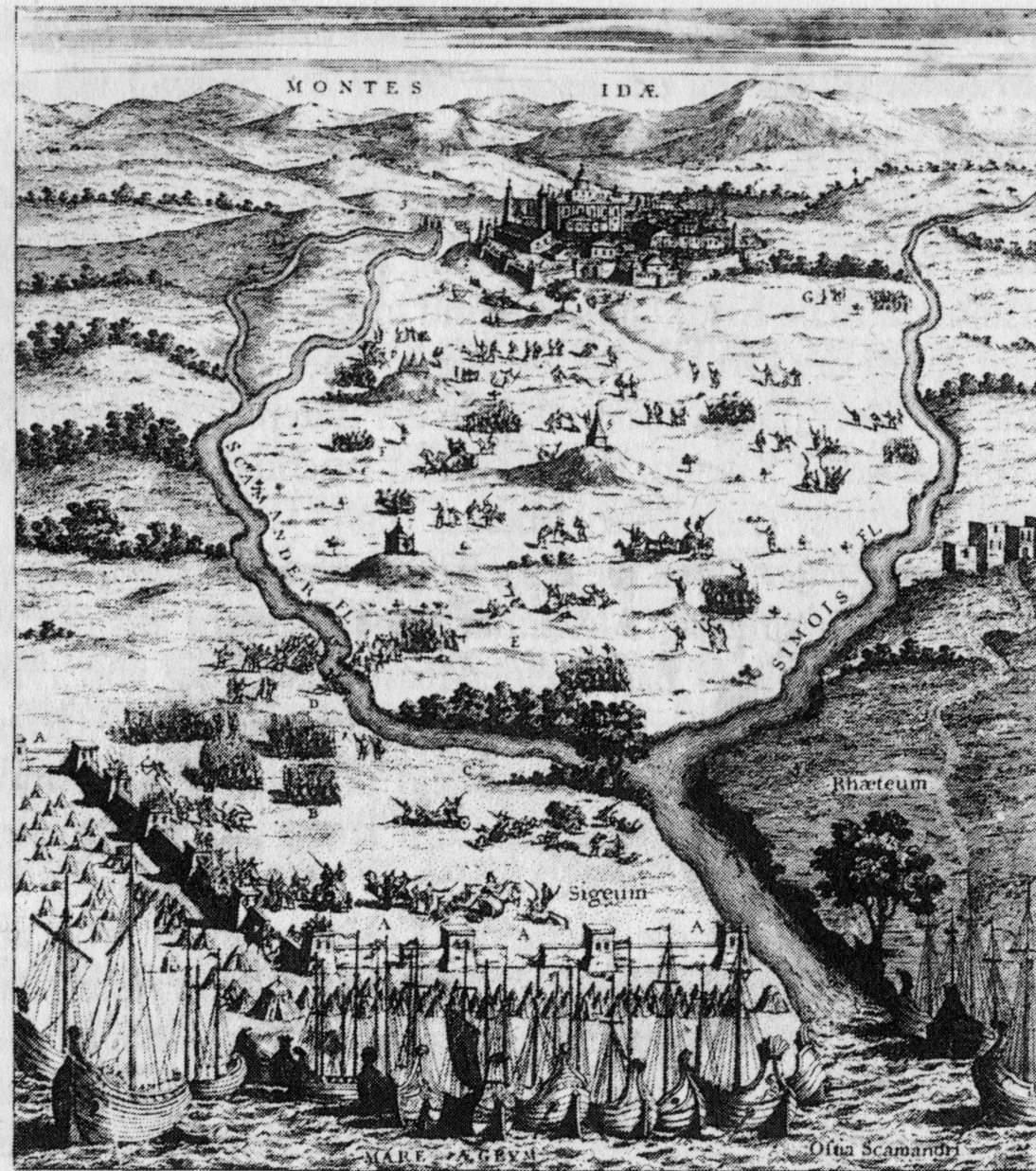
TROJA cum Locis pertingentibus. 1. Porta Scæa & Fagus. 2. Caprificus. 3. Fontes Scamandri duo. 4. Callicolone prope Simoim. 5. Baticea seu Sepulcrum Myrinnæ. 6. Heli Monumentum. 7. Tumulus Esfietis AA. Murus Achivorum. B. Locus Pugne ante naves in lib. 8. 12. 13. 14. C. Gesta Diomedis hoc loco lib. 5. D. Achillus & Scamandri Certatio lib. 22. E. Locus Pugne in lib. 6. F. Pugna in lib. 11. G. Pugna in lib. 20.