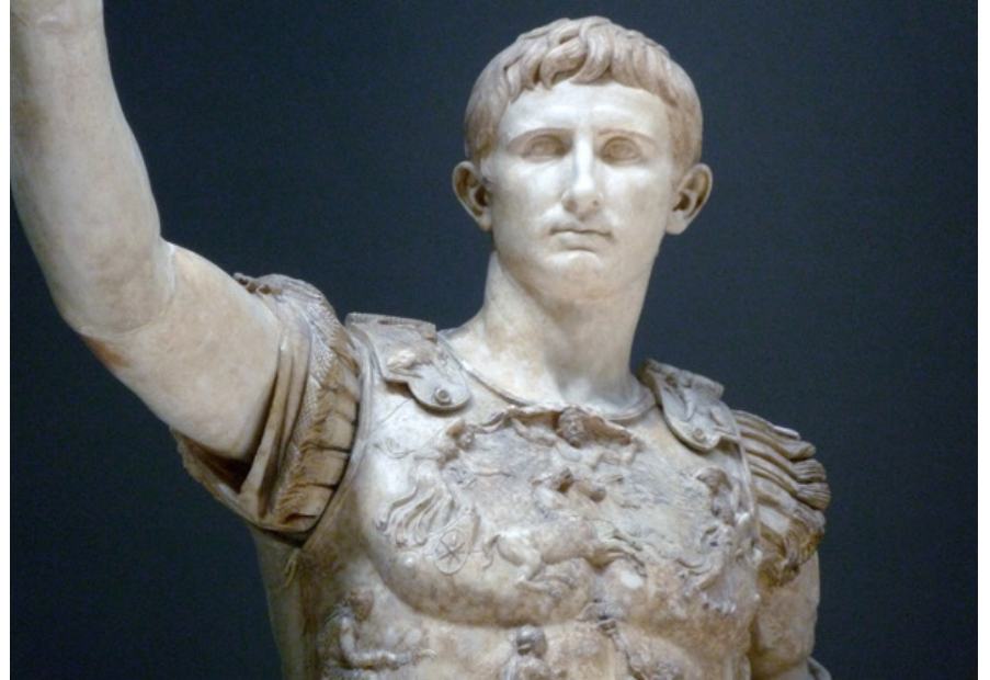
Augustus, 63 BCE–14 CE, ruled 31/27 BCE-14 CE