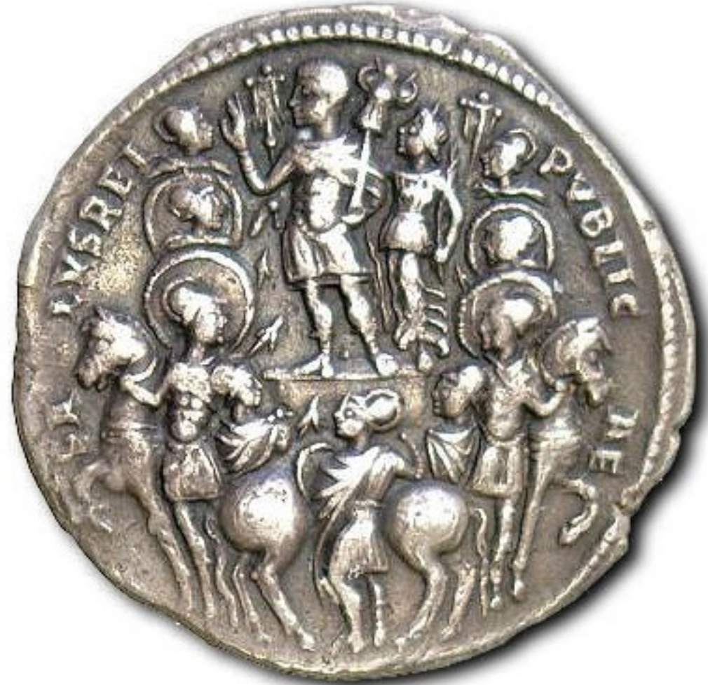
Constantine's 10 th anniversary SALUS REIPUBLICAE medallion (315 CE, silver, Münchner Münzsammlung)